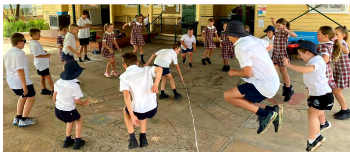
Playing 'round the world' at recess - needs speed and coordination!

Emmy and Fred are very excited to have been hand-picked to perform at Carols on Norton with Leichhardt Espresso Chorus on December 17th 2023. This is sure to be a musically spectacular, fun-filled festive performance. What a wonderful achievement - best of luck!