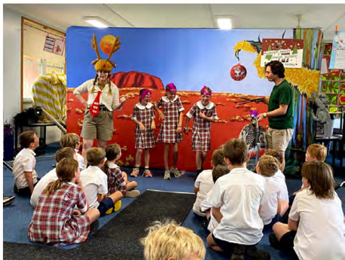
3 gorgeous emus - Tabitha, Nala and Rachel