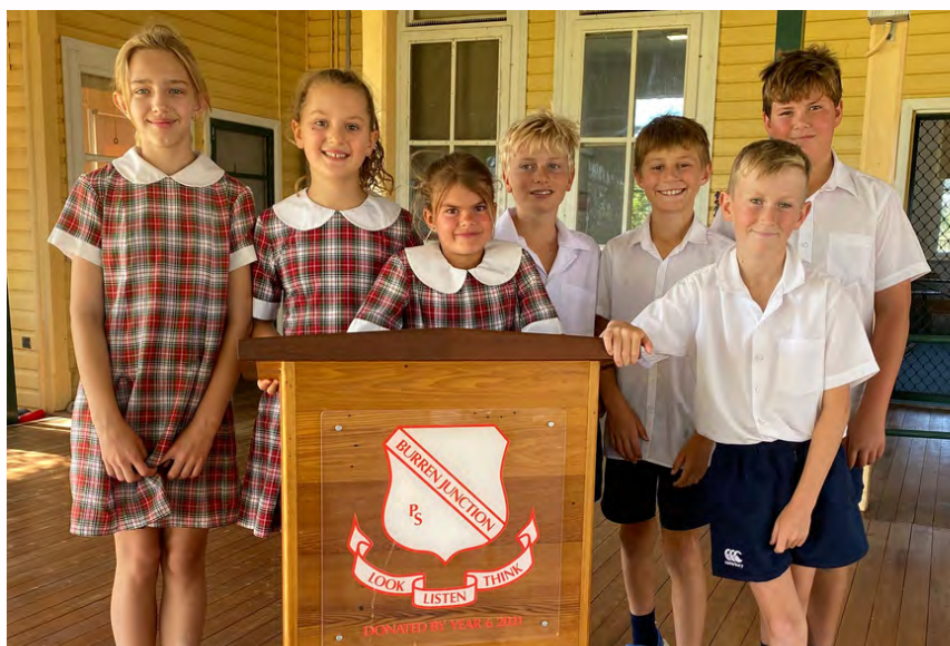
Outstanding Parliament speeches Y5!