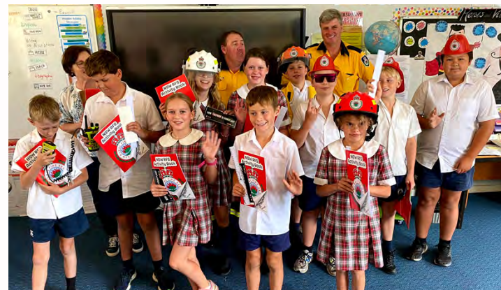
Y5/6 (and the teachers) learned a lot about fighting fires and fire behaviour.