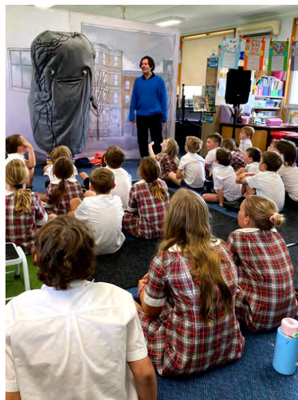
Mr Huff grew to be huge!