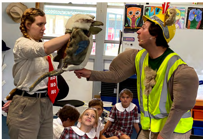
The wise kookaburra caught the crafty dingo out