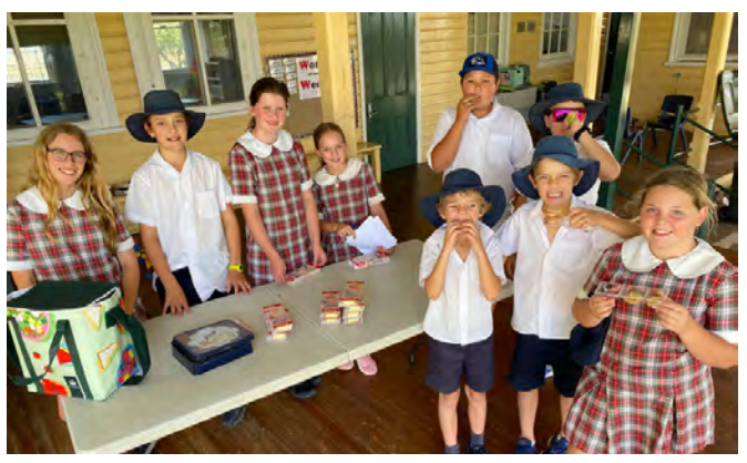
Student Parliament sold snack stackers as a fundraiser