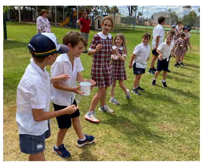
The firemen's drill

We had a front row audience of tiny, fancy-hatted spectators along the preschool fence to watch our Melbourne Cup race day afternoon activities. It was certainly entertaining to watch everyone K-6 join in skipping, crab crawl and three-legged races and then compete in house teams for the egg-and-spoon race, bean bag balance relay and firemen's drill with water buckets. Happily, the only injury was a smashed egg! The students looked stunning in their millinery creations and fascinators and School Parliament sold delicious Primo stacker snacks to add to the fun.