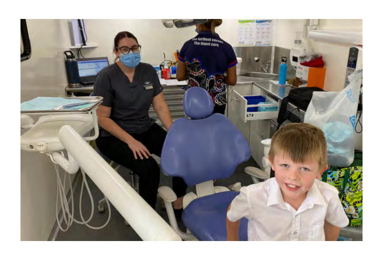
Ralphie all ready to get his teeth checked