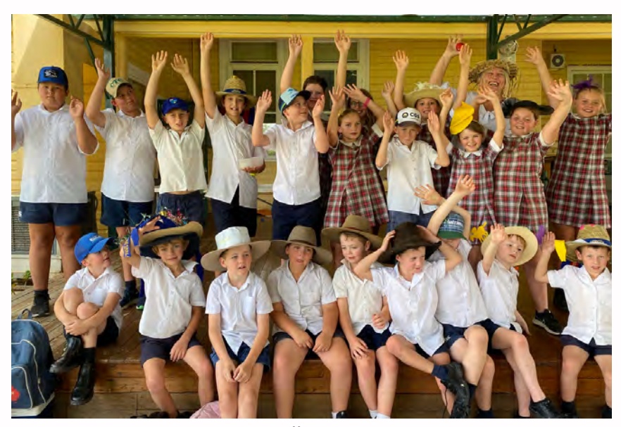
Sporting our Melbourne Cup Fancy Hats

With Term 4 more than half over, end of year festivities are just around the corner and the calendar is certainly busy. On Tuesday, I attended my first Christmas celebration with other staff and members of the Wee Waa / Narrabri Teachers' Association at Narrabri RSL's Outback Shack - a memorable experience as a first timer with simulated thunder, lightning and rain pouring off the tin roof above our table!