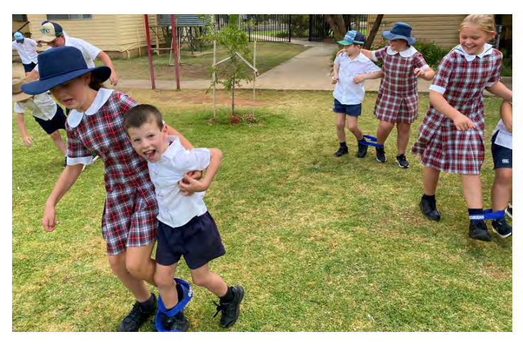
The three-legged race