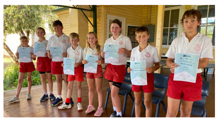
Newcastle Permanent BS Maths competition awardees