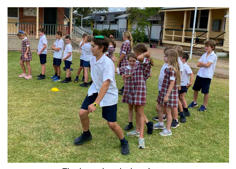
The bean bag balancing run