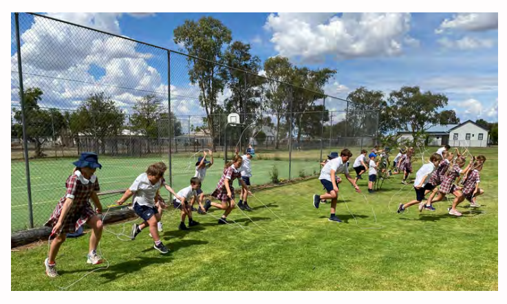
The skipping races