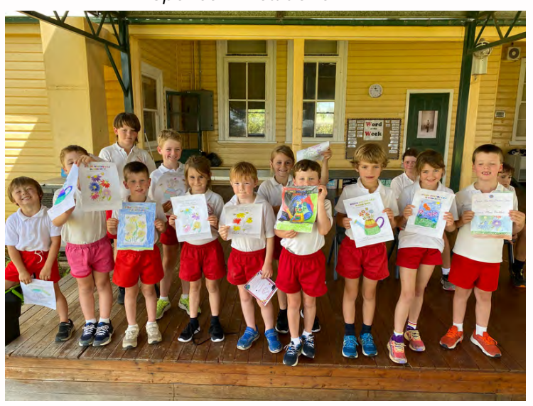
CWA Flower Show colouring comp entries returned from last term