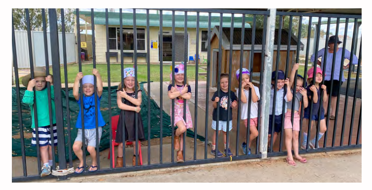
The preschoolers watching the fun in their race day hats