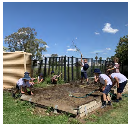
The 3-4 class hard at work in the school gardens