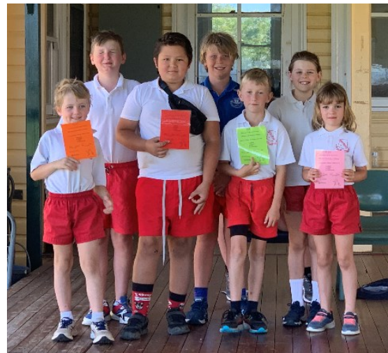
Peer Support Awards