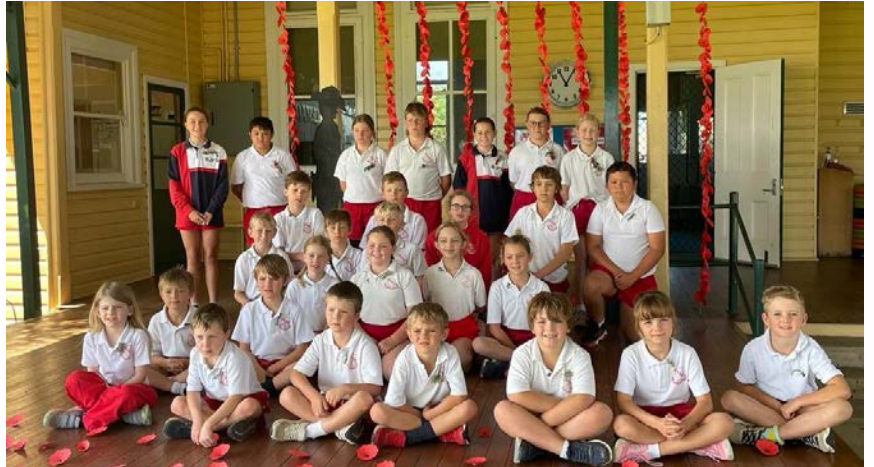
Remembrance Day 11th November 2022

Another busy fortnight at Burren. There is a definite harvest vibe filling the school, with talk of headers, chaser bins and bogged machinery among some of the many insights children have. We appreciate that it is busy for families and that things are not always running to schedule now. The next 3 weeks will be fast paced at school as well. Reports are being written, we are starting our swimming school and week 10 will see the Year 6 farewell lunch, a day in Narrabri with Rowena school and Speech Day. Just a reminder that as the weather heats up, lots of water is needed along with hats; I must say that it is rare for children not to bring hats and that is great to see.