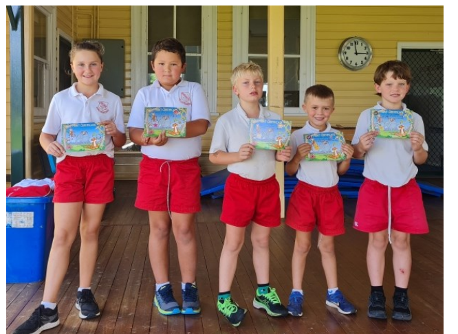
Awards at Assembly Friday 19th March