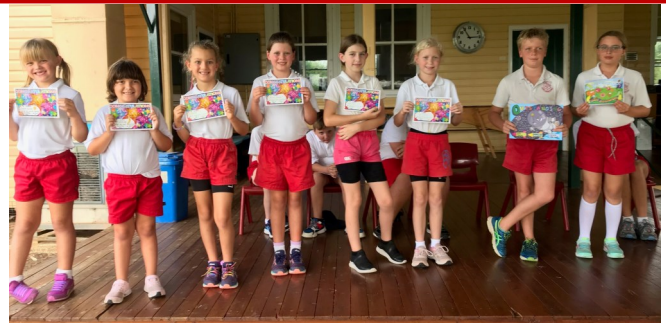
Awards at Assembly Friday 12th March

For the first time the Year 3 and Year 5 students at Burren Junction Public School will complete NAPLAN online. The only component of the testing that is in a paper format is the Year 3 Writing. Information about NAPLAN has gone home with the children in Year 3 and Year 5. If you would like more information please contact me at school.