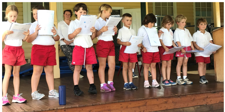
K-2 presenting at assembly on 19th March, 2021