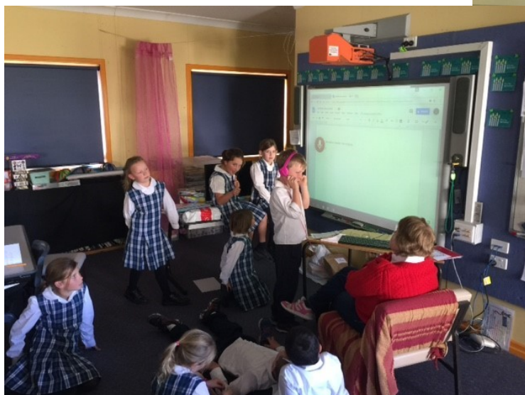
Mrs Cain and the 2/3 class using the 'voice to text' facility installed onto the IWB this week.